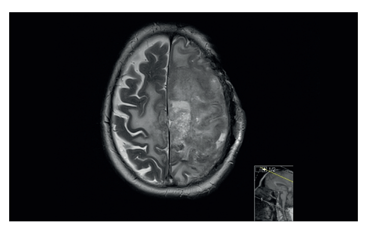
MRI postoperative, axial middle.

Always read the Instructions for Use which accompany the product for indications, contraindications, warnings and precautions.